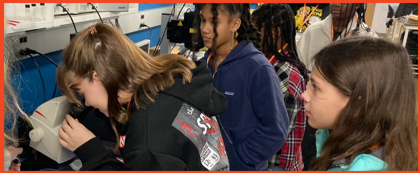
Saturday Academy field trip to a Carnegie Mellon University College of Engineering laboratory

In 2022-2023 we gave our STEM Stars students 7 opportunities to connect with mentors and explore potential college and career paths through Saturday Academy field trips to institutions like the Pittsburgh Institute of Aeronautics and Carnegie Mellon University.